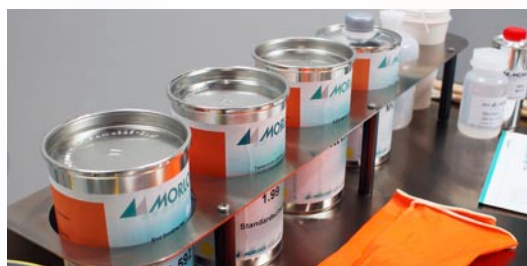
Rack for inks and auxiliary means

Optimized for the pad printing users, the new MW700 2.0 is equipped with shelves to store auxiliary items, pads, tools and much more. For cleaning jobs a paper towel rack with towel holder is also integrated.