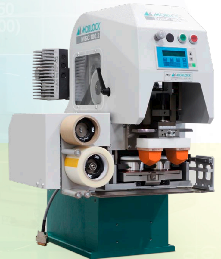
MSC 100.2-2 (with double ink cup)