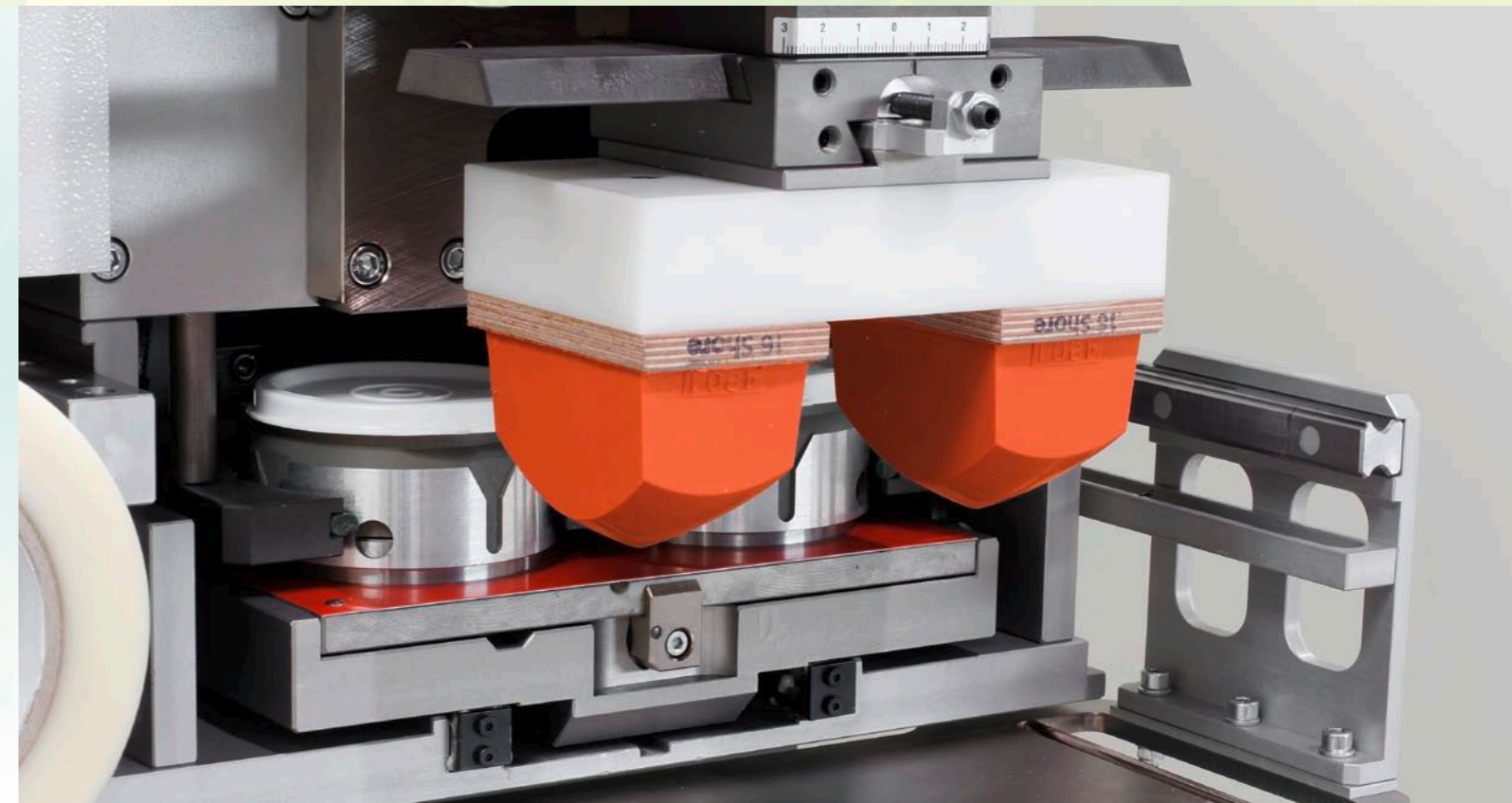
NEW! MSC 100.2-2 with double ink cup