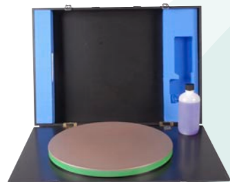
Lap and polishing kit