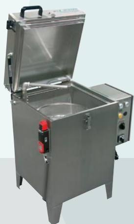
automatic washing-up unit K40